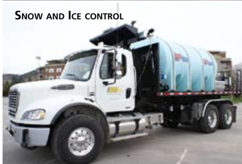
SNOW AND ICE CONTROL