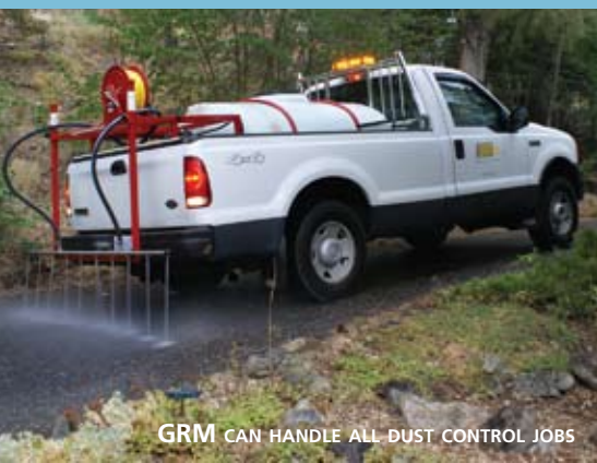
GRM CAN HANDLE ALL DUST CONTROL JOBS

Our "One Call Does All" services are offered in the following regions: