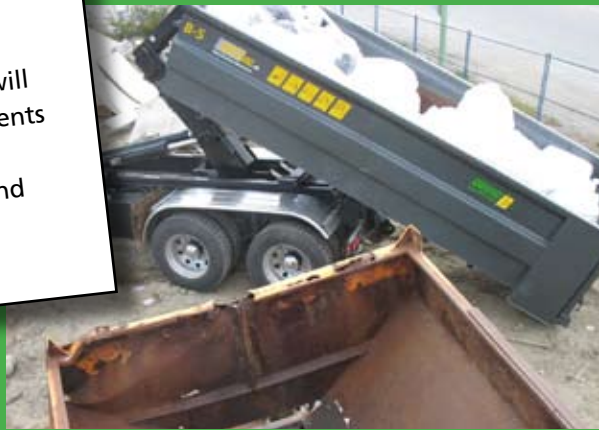
GRM transports Styrofoam to Poly Rock's bin chipper.

Other businesses that have their EPS packaging materials recycled include Okanagan College, Quails Gate Winery, Global Surface and various local restaurants. For more info, please visit www.polyrock.ca .