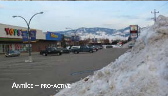
ANTILCE – PRO-ACTIVE