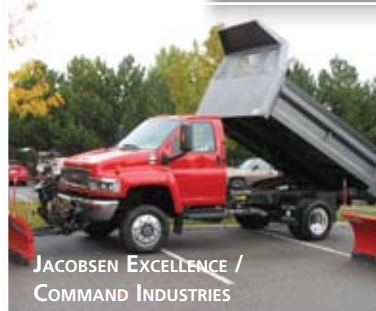
JACOBSEN EXCELLENCE / COMMAND INDUSTRIES