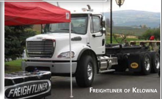
FREIGHTLINER OF KELOWNA