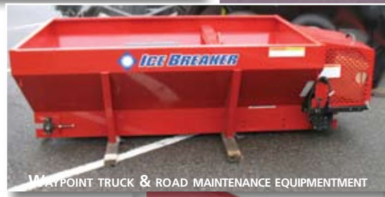
WAYPOINT TRUCK & ROAD MAINTENANCE EQUIPMENT