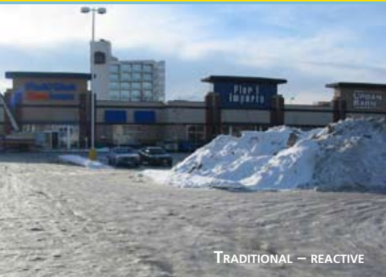
TRADITIONAL – REACTIVE