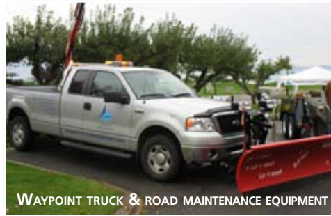
WAYPOINT TRUCK & ROAD MAINTENANCE EQUIPMENT

GRM would like to thank the following sponsors for contributing to the success of the 1 st annual Pre-Snow Golf Convention: