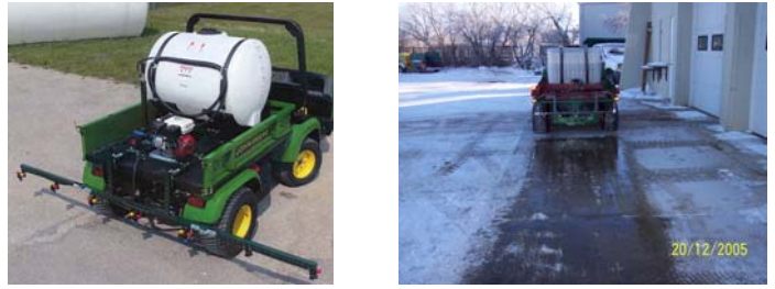
"Ma & Pa" spray rigs for Gator or truck