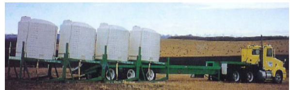
200 to 5,000litre storage systems