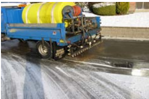
Full sized spray rigs