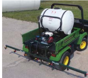
"Ma & Pa" spray rigs for Gator or truck